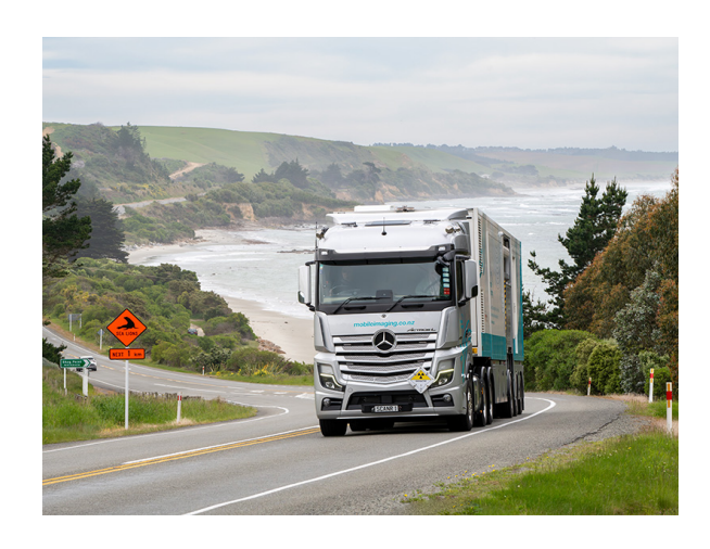
Pictured above: Mobile Imaging unit travelling to Dunedin.

To make a referral, please email booking@mobileimaging.co.nz or call the team on 0800 001 185. More information on referrals can be found <a href="here">here</a>.