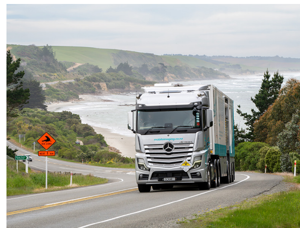
Pictured above: Mobile Imaging unit travelling to Dunedin.