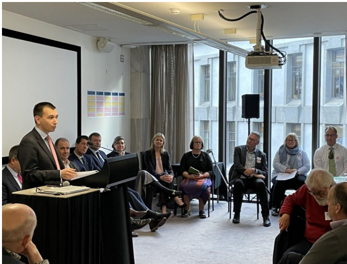
Pictured: Honourable Simeon Brown. MP · 45th Minister of Health.

HTRHN will publish a full list of RuralFest 2025 priorities in the coming weeks.