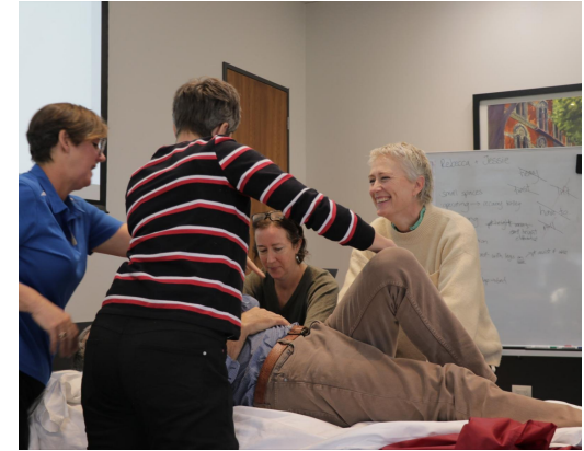
Pictured: Hands on care: CPR training session.