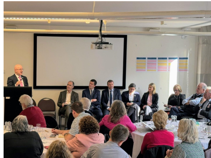
Pictured: Honourable Matt Doocey, Minister for Mental Health & Associate Minister of Health.