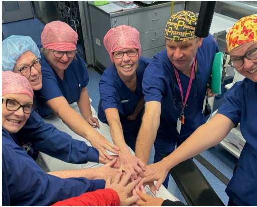
Pictured: Clinical team onboard the MSU.