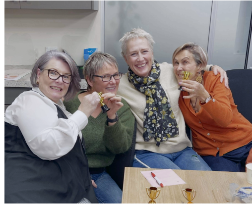
Pictured: Clinical team sharing smiles and success.