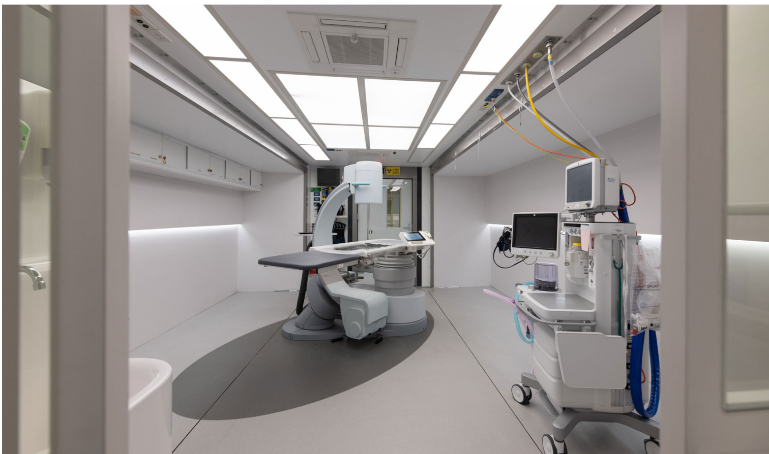
Pictured above: The lithotripsy unit provides a mobile treatment environment with a dedicated state-of-the-art Extra Corporeal Shock Wave Lithotripsy (ESWL) machine for the treatment of kidney stones, as well as other urological procedures.